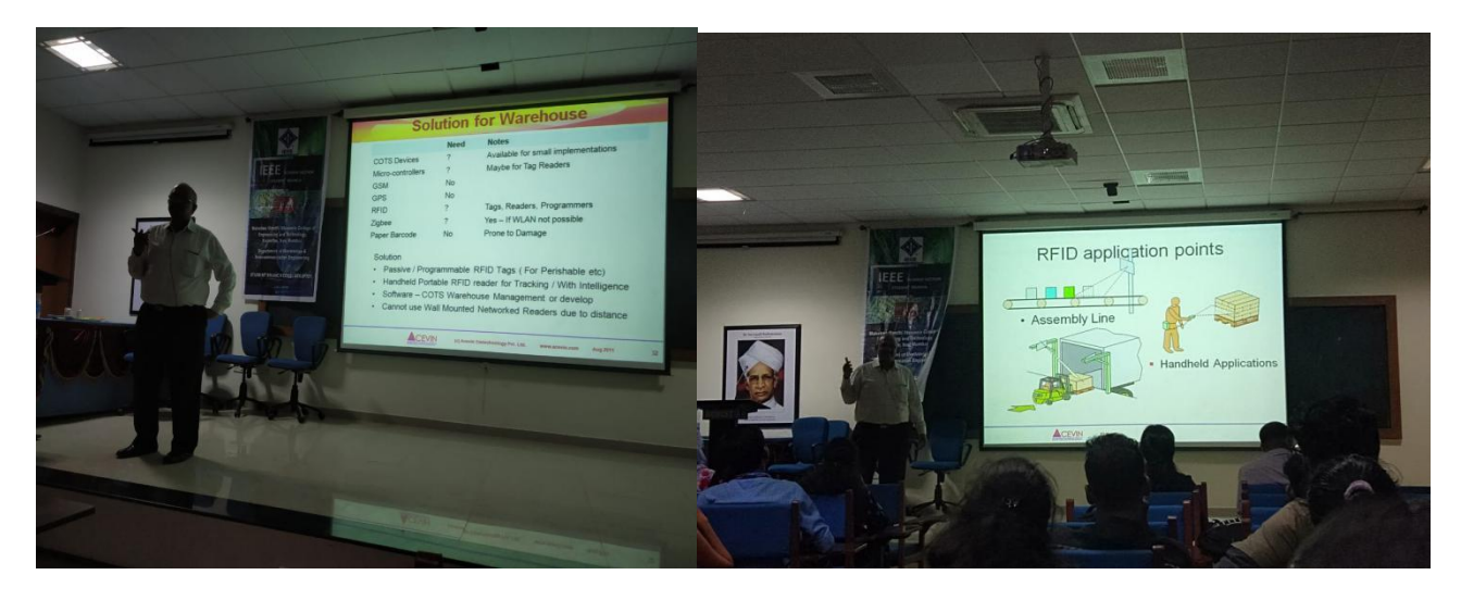
Fig 5:- Solution of Warehouse