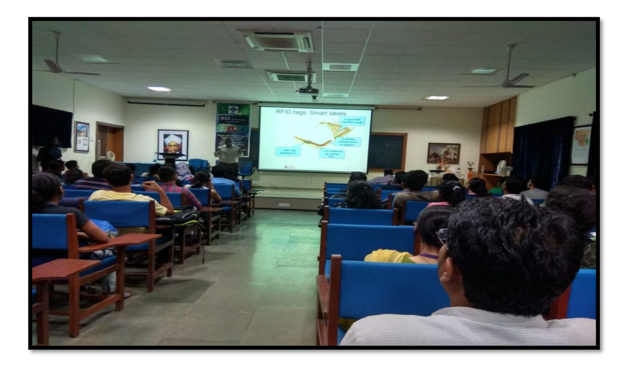
Fig3:- RFID tags -Smart labels