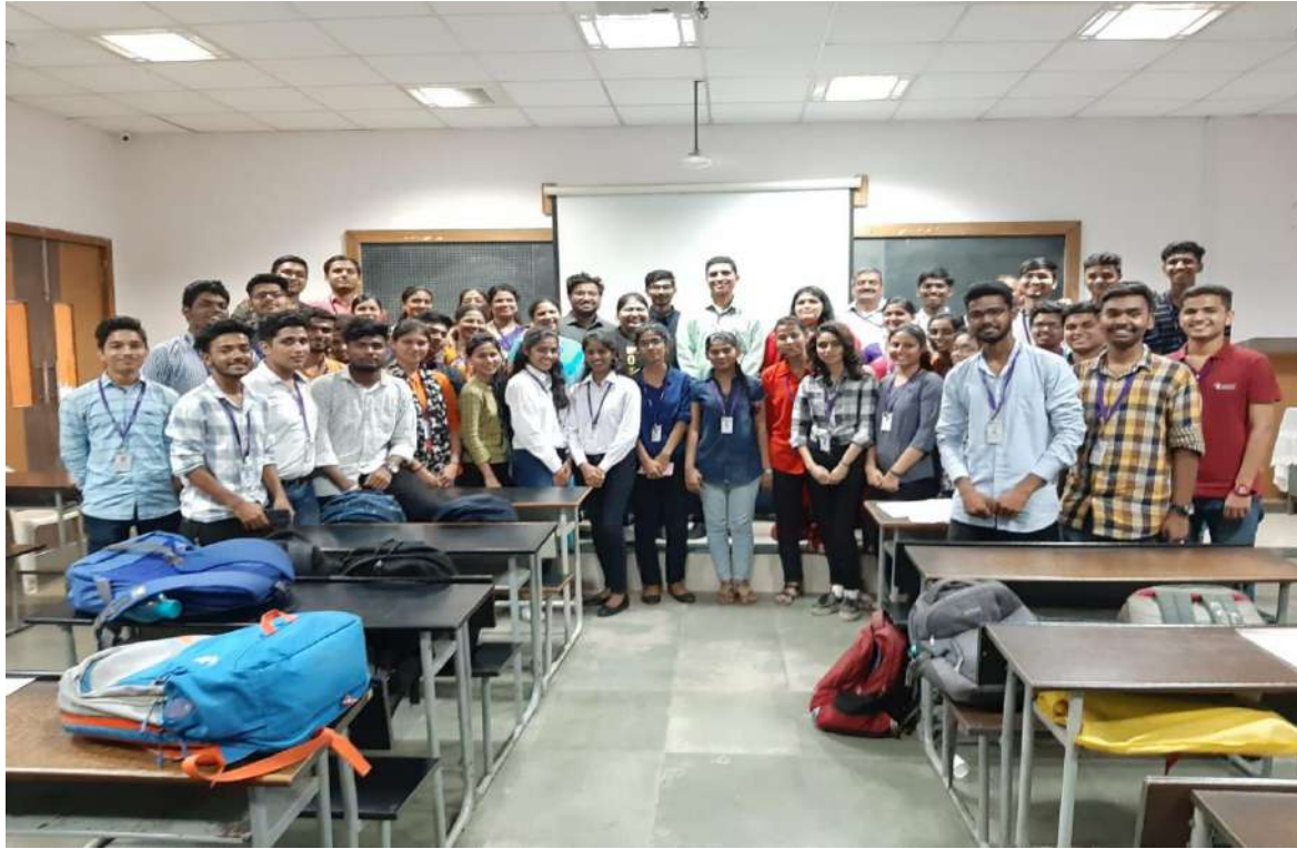
End of the workshop