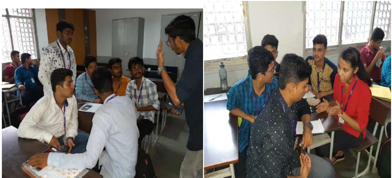
Solving problem by group discussion