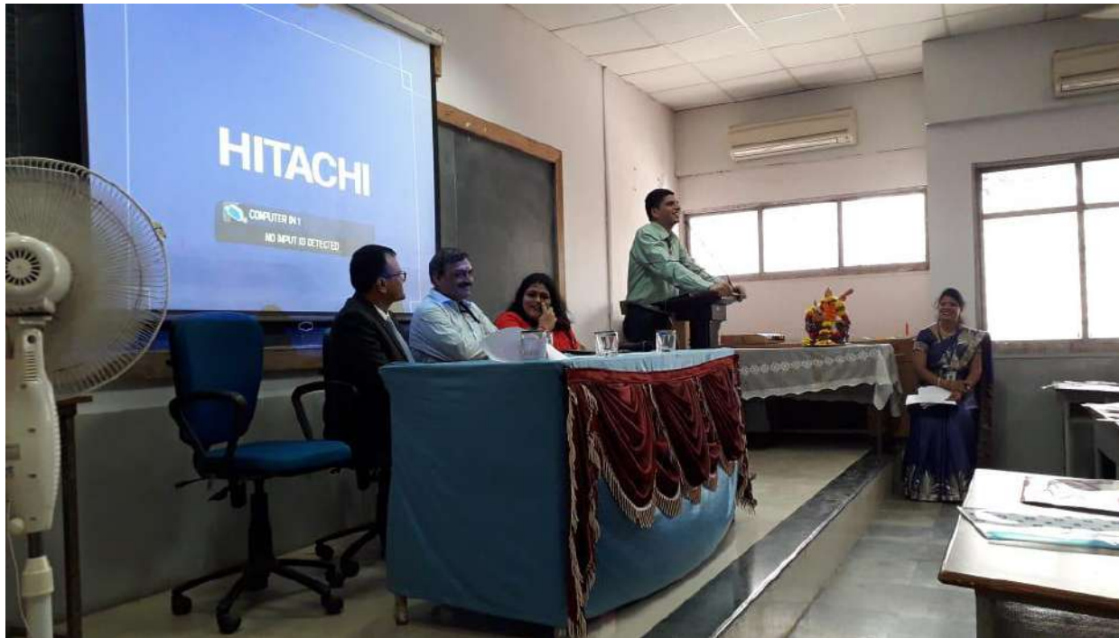
Address by Principal Sir