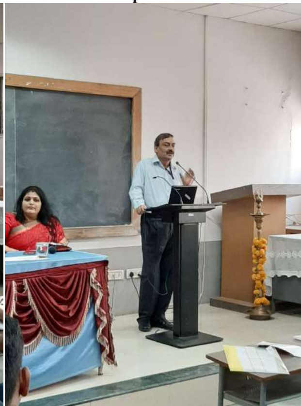
Guidance By Dean Academic