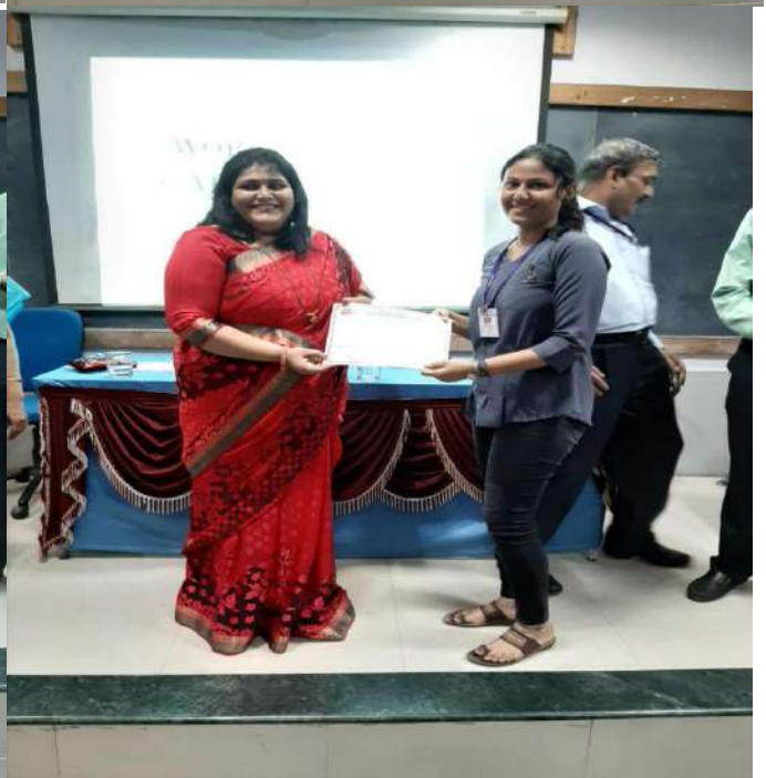
Distribution of certificates to participants