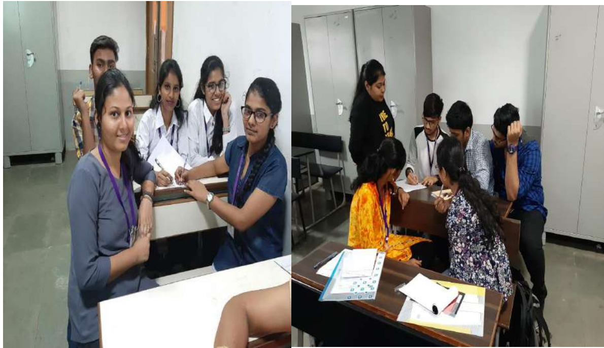
Team work solving problem