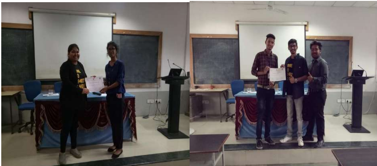
Participants are receiving Certificate