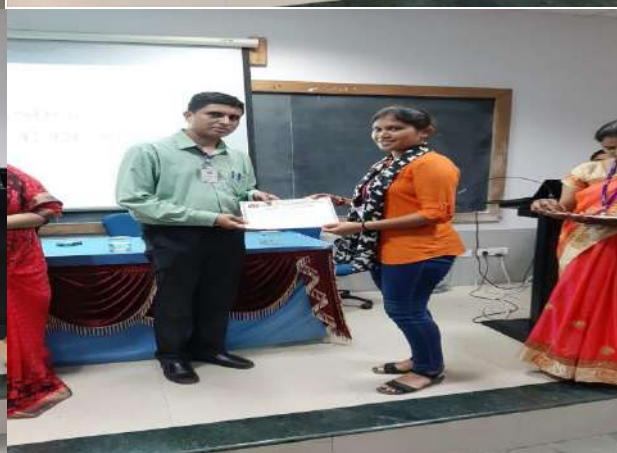
Distribution of certificates to participants