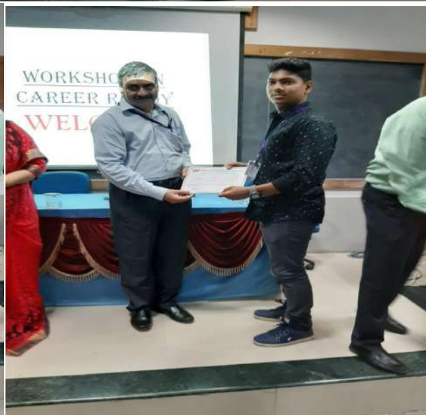
Distribution of certificates to participants