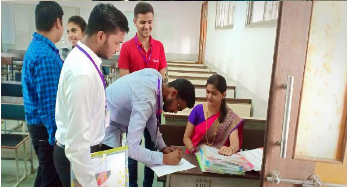
Registration of FE students for Workshop Total 33 students participated in this workshop