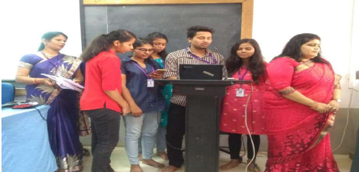
Lamp Lighting with Saraswati Vandana and University prayer