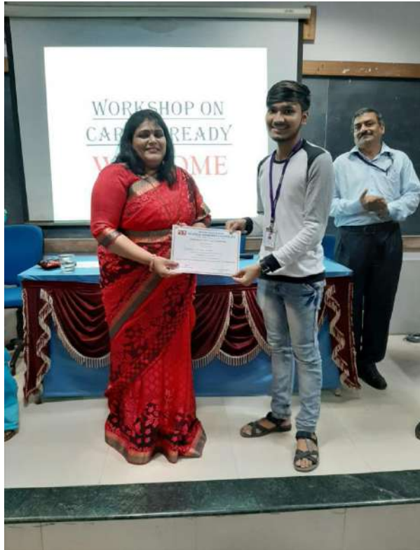
Distribution of certificates to participants