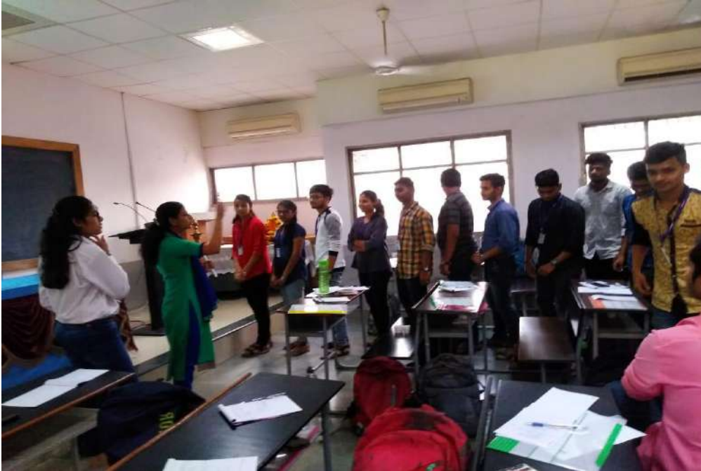
Interaction with the students

As we know every technology works only almost for a decade. So, there is necessity of new inventions in the field of technology which can be given by upcoming engineers. For this they need to be acquainted with both hard skills and importantly soft skills.