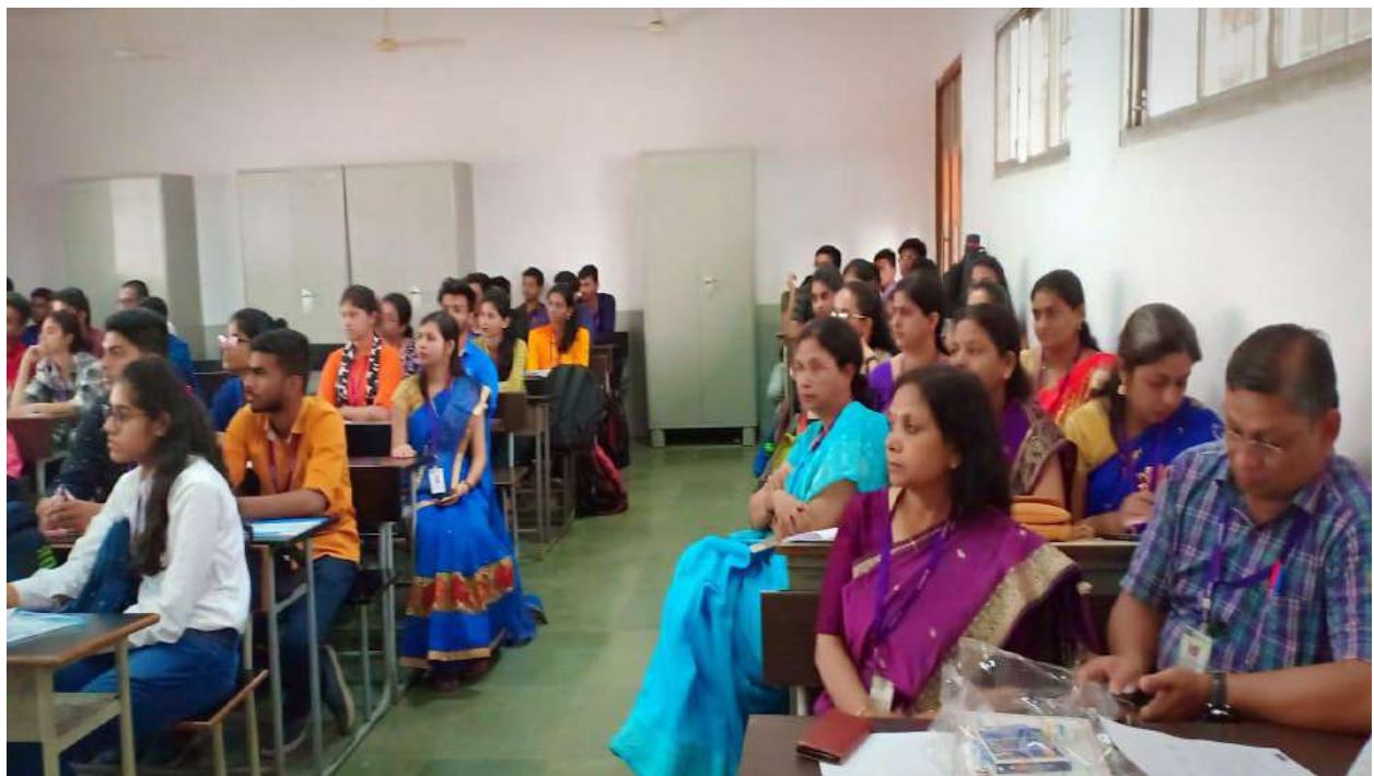
Faculty and students of FE attending workshop