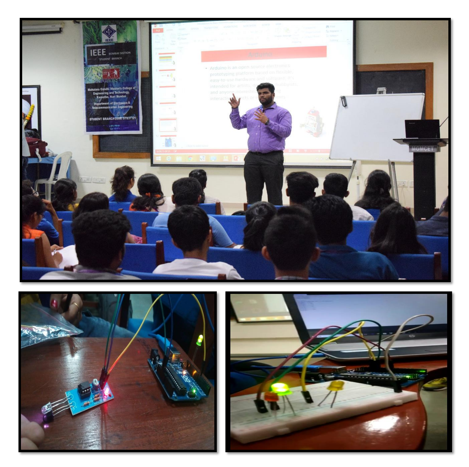
Fig 2 :- Introduction on embedded system and first project

On the first day, 8 projects were completed that enlightened the students with a rich knowledge of Arduino and its programming, Infrared Sensors (IR sensors), Ultraviolet Sensors (UV sensors) and LEDS. The day came to an end by responding to all queries and a quick sneak peek into the next day projects. The participants dispersed with great curiosity and craving for more.