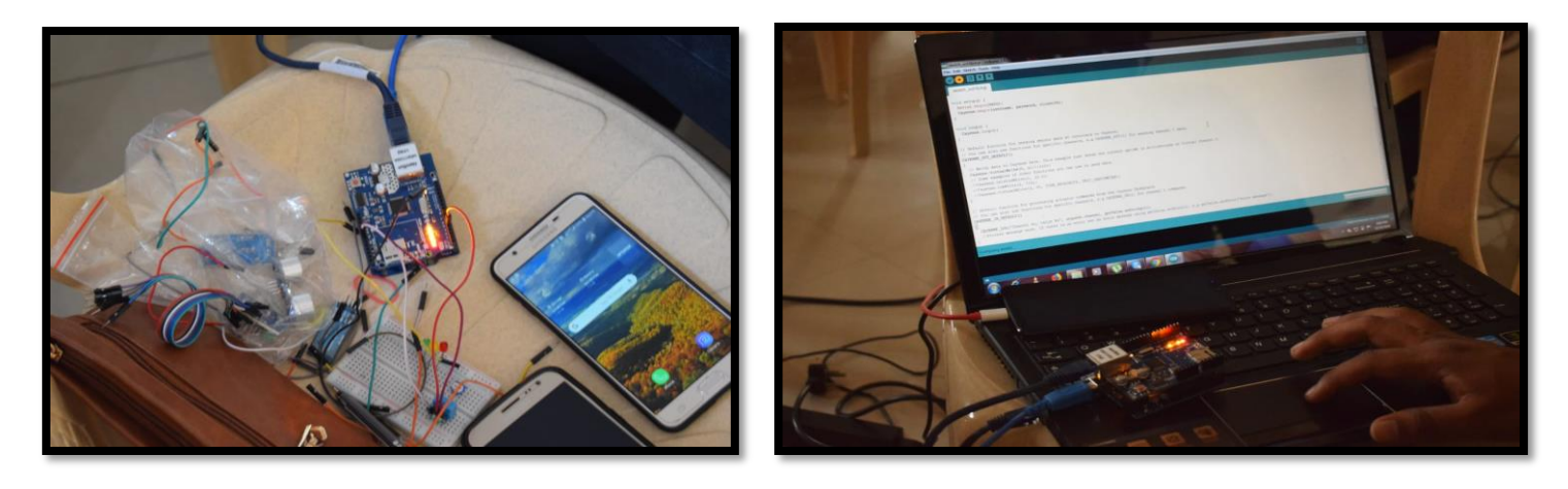
Fig 6 :-Home automation using android app