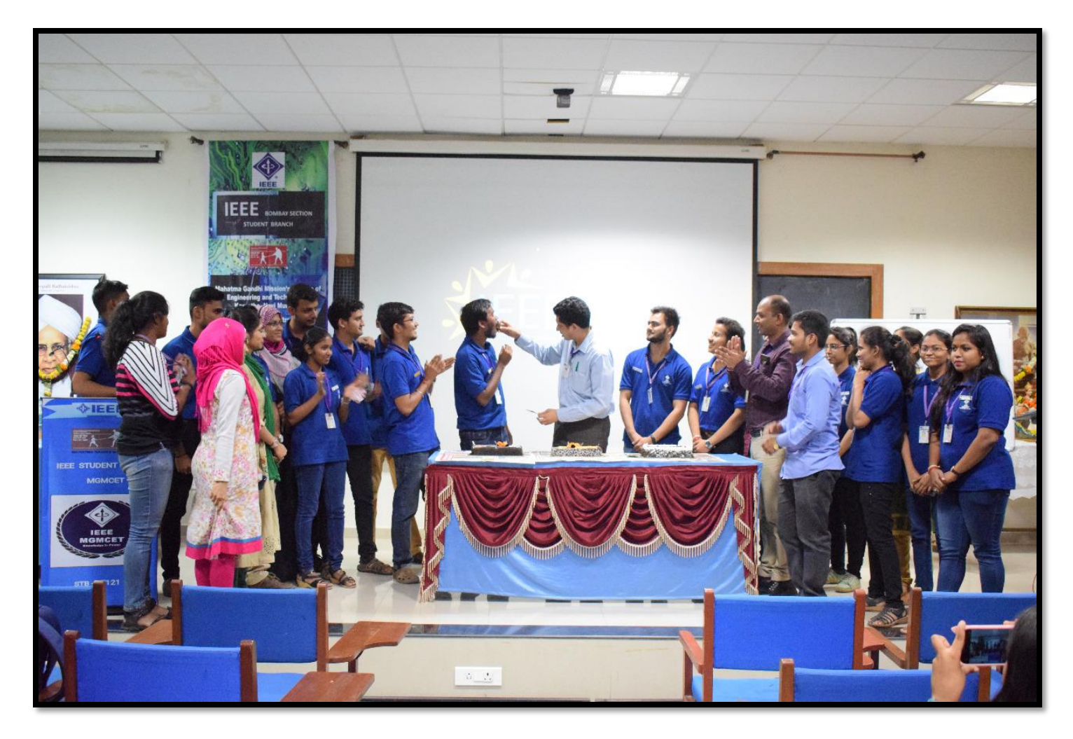
Fig 4:- Celebration of IEEE day