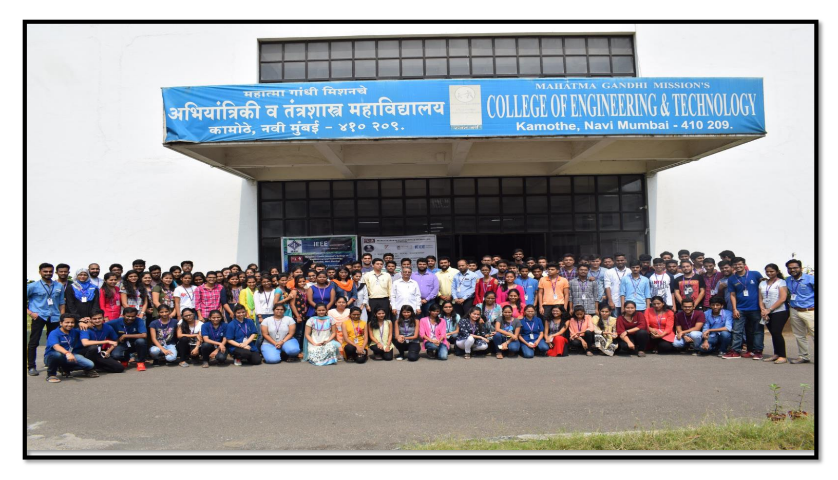
Fig 19 :- End of workshop picture with DG Sir, Principal Sir, HOD Sir, Faculty, IEEE Members and Participants