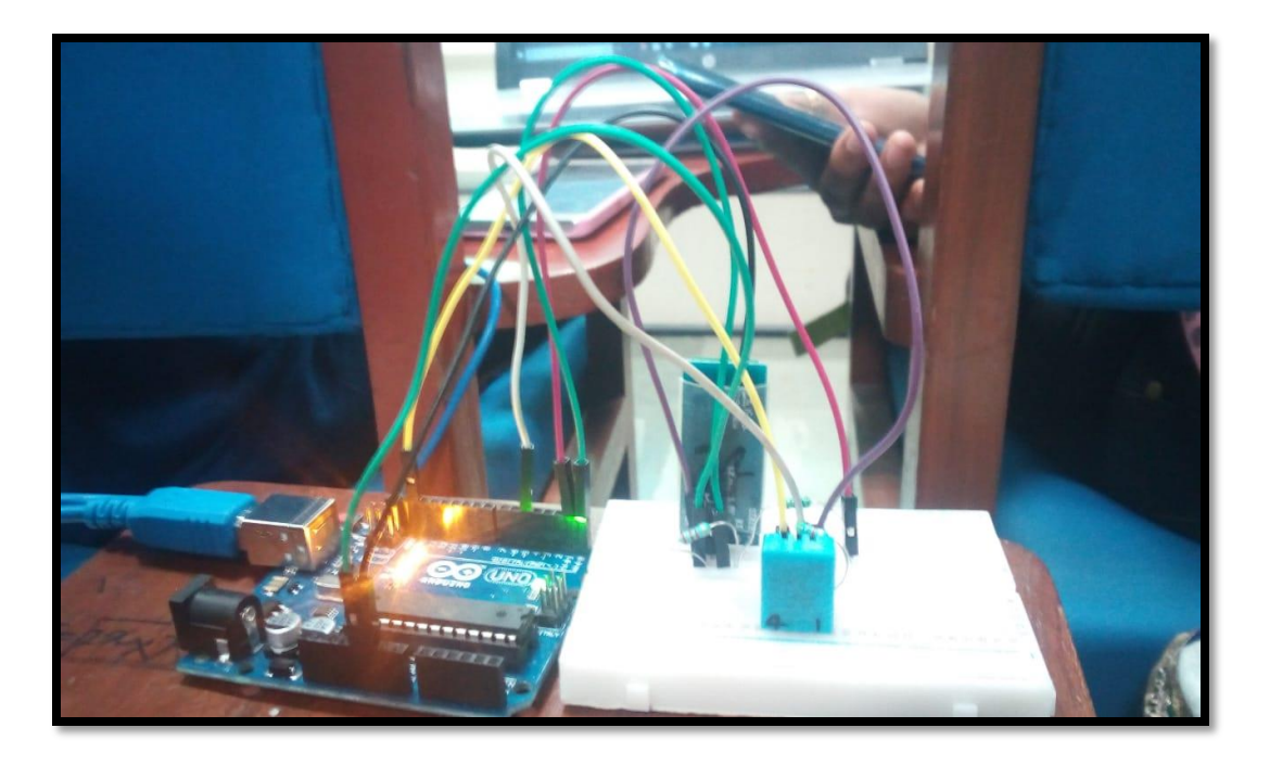
Fig 3:- Project on Reading Humidity and Temp of environment

The day started with some of the participants coming up and giving an honest feedback about the workshop day 1, what they liked the most and what they found not so good. Then all the students focused on the projects for the day. The very first project involved knowing the concept and working of LDR. It was followed by the working of temperature & humidity sensors. Then the students were introduced to Bluetooth sensors and they built 4 projects using it, some of which included reading the values of temperature & humidity sensors on their phones, making a mini home automation system and controlling it using android smartphone and their voice! Sounds cool right......!! In totality, that day 6 projects were completed. But wait, the day didn't end with that. After the workshop session, IEEE student branch MGMCET celebrated IEEE DAY that included cakes being cut and a motivational speech by the respected principal of MGMCET which left the experienced IEEE members with satisfaction of accomplishment and the young members with zeal and enthusiasm to do even better than their seniors. Well that's the end of Day 2 with all the participants leaving college premises with a big smile on their faces, all thanks to the workshop and the yummy dark chocolate cake!