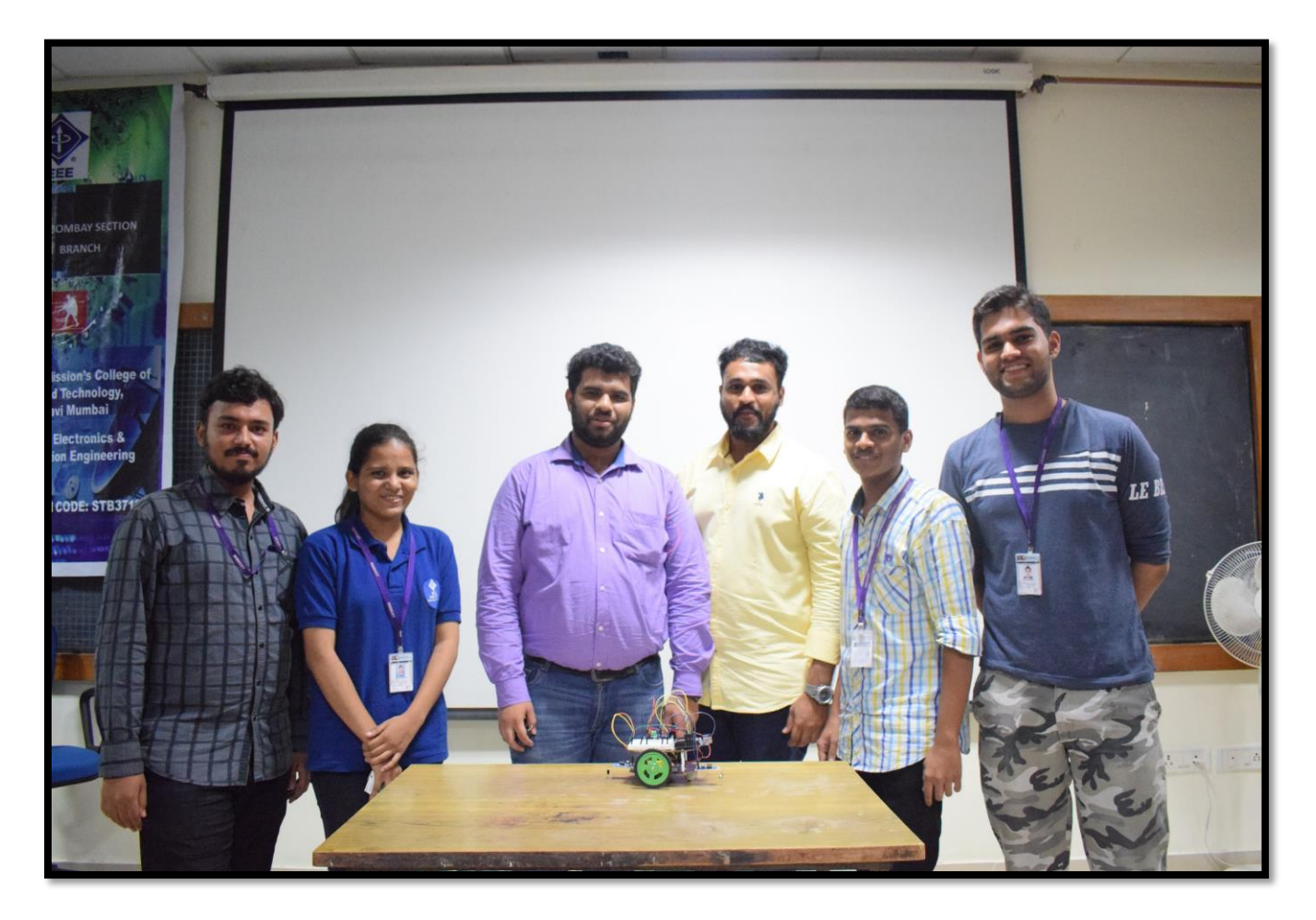
Fig 16:- Winners of Robotics competition

Fifth day ended on the note of Robotics Competition conducted by the trainers. The problem statement was that the students had to make an Edge Avoider Robot in about 45 minutes. The winning team was also given a chance to visit Varanasi for further competition. At the end of the day all the participants were felicitate with certificate of participation while the competition winner with Certificate of excellence.