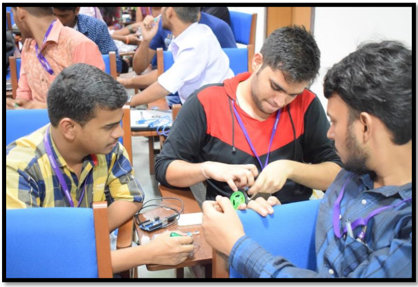
Fig 11 :-Students making their Robots.

The Line Follower Robots were then tested on the line follower track for knowing the actual functionality and working principle of the same. Doubts related to the working issues of the Robots were also cleared by the trainers.