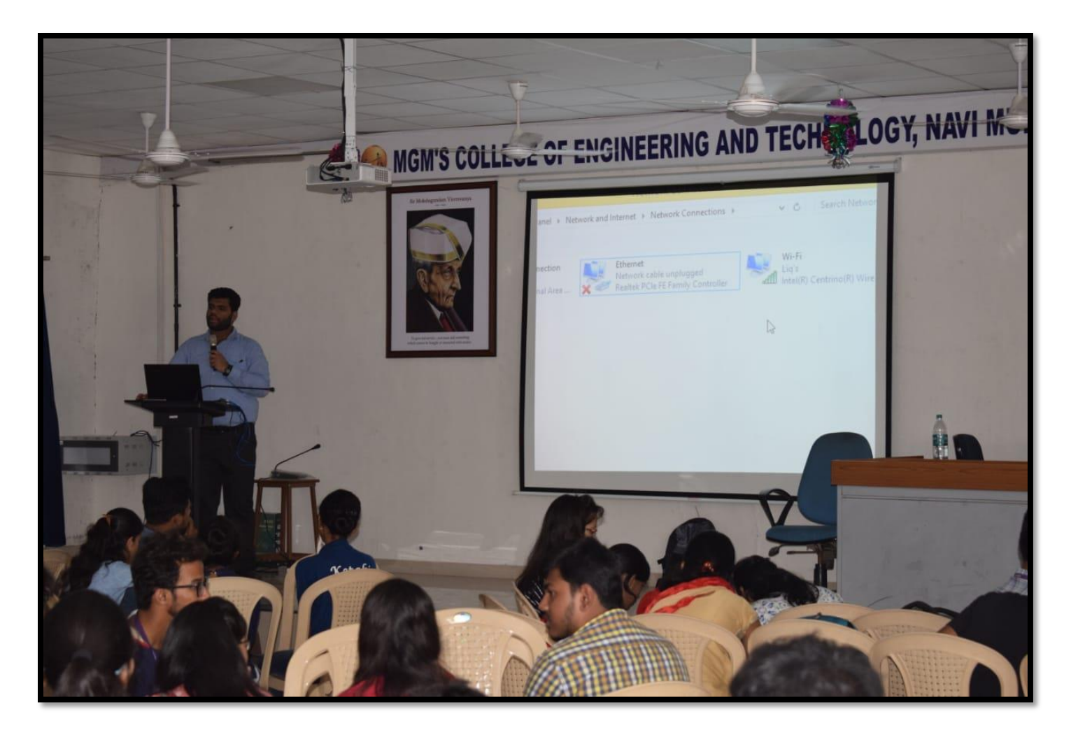
Fig 5:- Explanation on IoT