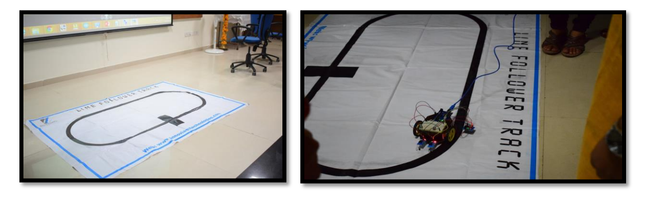
Fig 12:- Line Follower Track

The Line Follower Robots were then tested on the line follower track for knowing the actual functionality and working principle of the same. Doubts related to the working issues of the Robots were also cleared by the trainers.